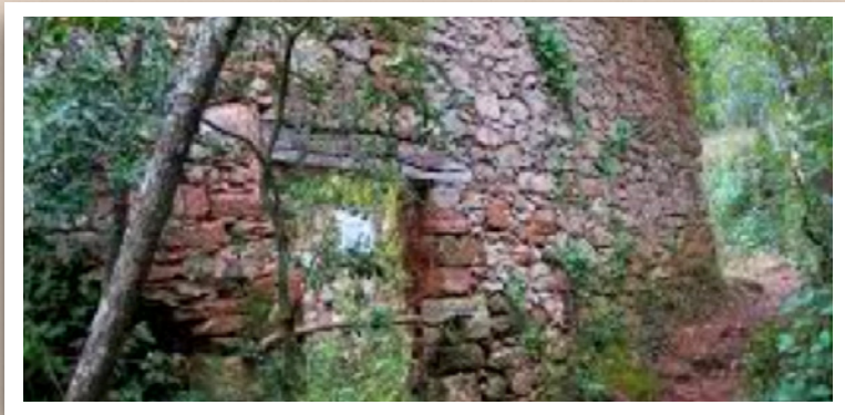
Old lime kiln

This path, created on last year 2002, visits our more exceptional viewpoints of Caldes environment: Casuc Hill. This hill is over Morro de Porc, from we have a wonderful view with panorama of Sant Feliu de Codines, Montseny and Cingles de Bertí. The route goes close to ancient ruins of lime kilns situated in Farell Mountain.