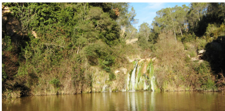
Gorg de les Elies

It's a circular trail following PR-C 9 bases but it's not necessary to step backward to Caldes. Once we have arrived to the so-called "Gorg de les Elies" through PR-C9, instead of climbing to Sta. Mffi del Grau we can come back to Caldes, along the stream. We will go through Caldes ancient stone quarry. Where, by late nineteen century, thousand of flagstones carried by heavy carriages pulled out by draught oxen to the village train station. They were taken to Barcelona and other places by railway.