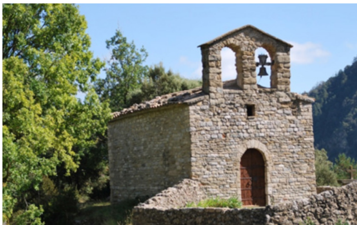
Santa Maria del Grau hermitage

GR-5 runs close to Caldes that meets Canet de Mar and Sitges by the inside line. PR-C9 is a short trail that meets Caldes with this GR-5 at Santa Maria del Grau Chapel. From Serra Llisa we can be astonished at the wonderful panorama or stop us at Sant Sebastià de Montmajor.